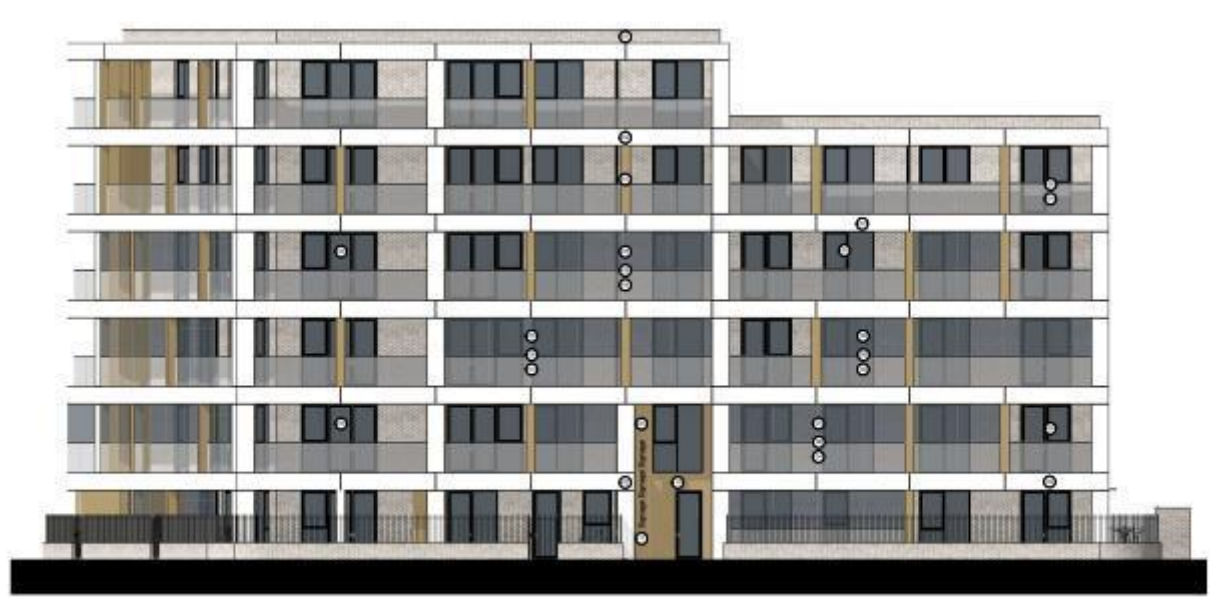
1 - Kilburn Park Road Elevation