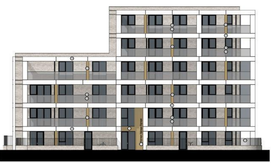
3 - Chippenham Gardens Open Space Elevation