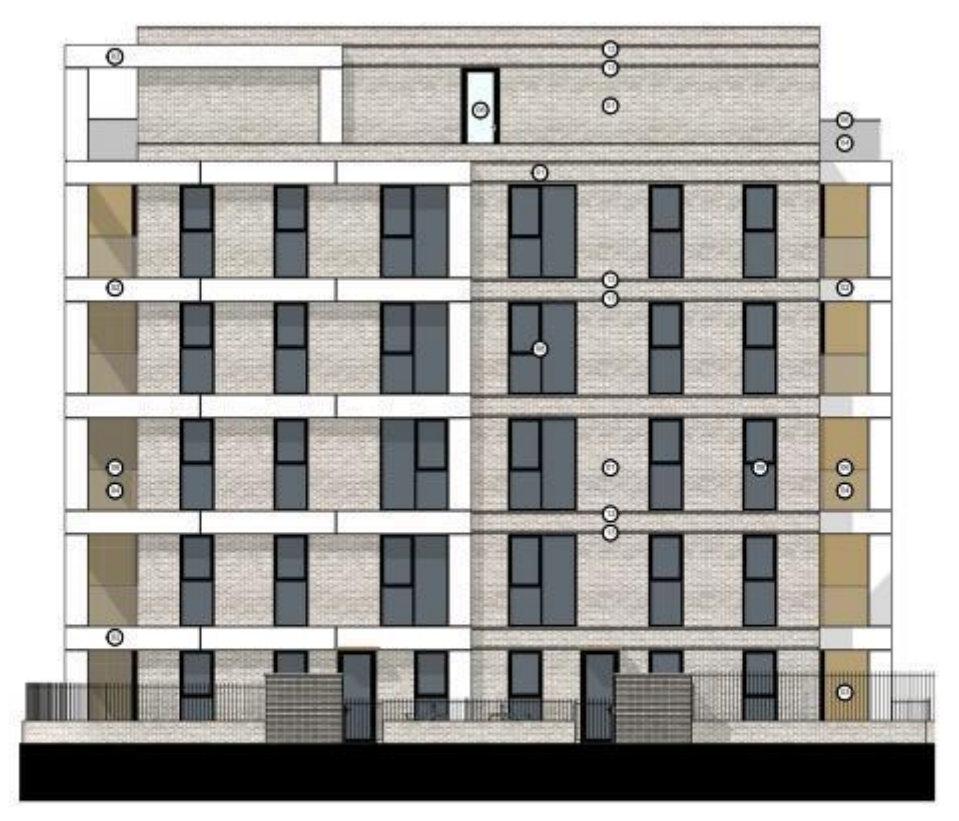
8 - Footpath Elevation