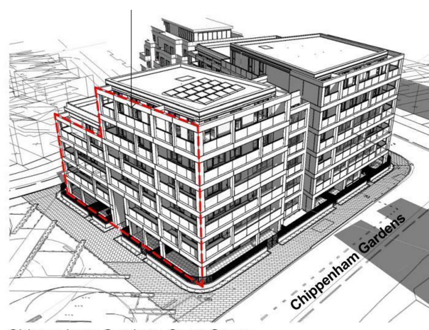
Chippenham Gardens Open Space